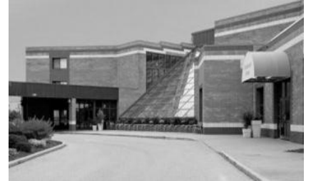
Holiday Inn Convention Center Manitowoc, Wisconsin

Our annual convention this year will be held at the Holiday Inn